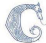
Cranmere Primary School

The Abu Dhabi Triathlon Team generously contributed Euros 5,000 to the flood relief effort being coordinated by KMT in collaboration with its partner NGO, De Laas Gul Welfare Programme (DLG). This was supplemented by a further donation of approximately Pounds Sterling 500 from the Cranmere Primary School, Surrey, United Kingdom. This second donation was particularly special because children had collected the funds during a non-uniform day arranged at their school in aid of the victims of the Pakistan flood. For a donation of £1 each to the fund, students were allowed to come to school in their casual clothes on the day.