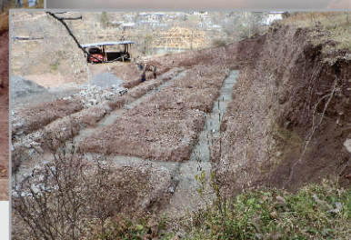
Foundation of the Construction Site