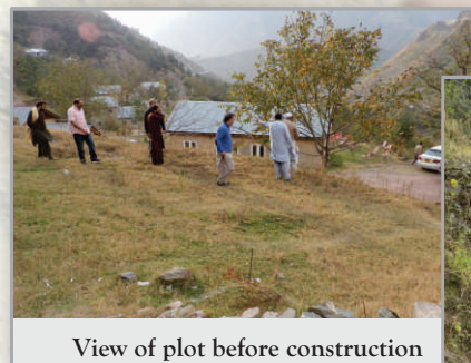
View of plot before construction

Land surveying, excavation and laying the foundations work were completed for the new building by the end of December. Weather permitting, construction work on the building shall continue over the winter break, to ensure that we meet the project completion target of October, 2014, by which time the new facilities are scheduled to be constructed and furnished.