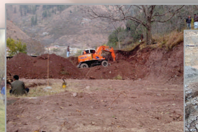
Leveling of the Construction Site