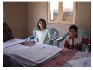
Children being interviewed during student selection

followed by half yearly progress reports. By sponsoring a child, you will help directly ensure that your sponsored boy or girl receives a good education and has a chance of attaining economic security later on in life. Having access to such opportunities was nothing but a dream for these children until now.