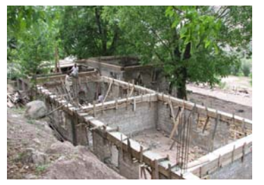
Work in progress on the first academic block

These children will go through a foundation semester prior to