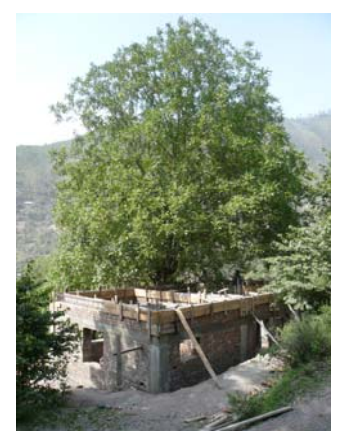
A teacher residence under construction. Teachers will be accommodated on campus

The teachers, Pakistani and International, are being re-