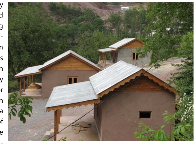
Temporary classrooms nearing completion

The school will therefore start with sixty children, divided into two classes of thirty, and with each class comprising of